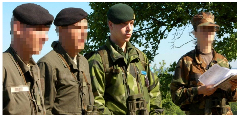
Figure 1: National and international Officer Cadets during the leadership training Crisis Management Operations. 5

The essay text following the description is to be separated from it by pressing the enter key once. Example: