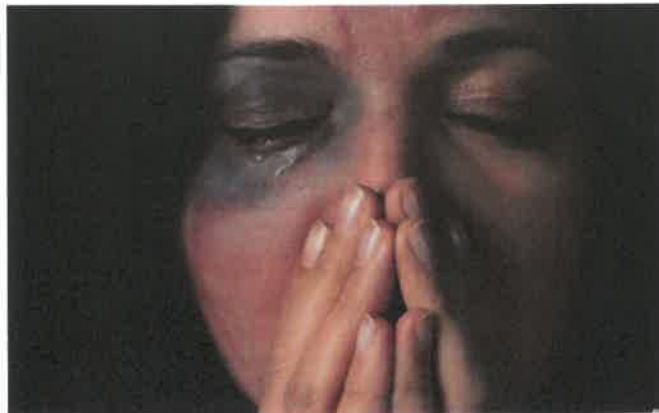
Figure 1: BRAZIL: Over 12,000 Women Are Daily Victims of Violence 4

In terms of facts and figures, at least one in three women in the world has been beaten (as in the picture), forced to have sex or abused for life, according to research based on 50 surveys around the world, one-fifth of women say that they were sexually abused before the age of 15, and almost 70% of the victims were killed by their life partners, according to the World Health Organization.