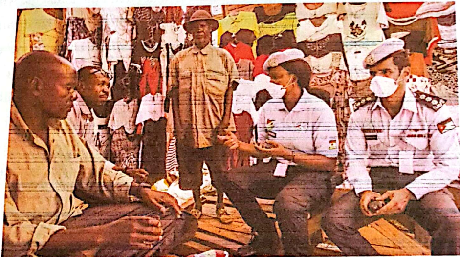
Figure 4: The United Nations Police discussing to civilians 4

As you might expect, they primarily serve the same functions as civilian police officers: to defend life and property by guarding the community of all Member States from all types of crimes and to ensure a safe and peaceful environment.