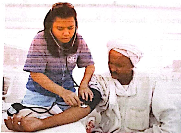
Figure 1: specialized civilian doctor consulting a patient 1

Civilians work in finance, logistics, human resources, communications and technology, and general administration to support the military's role in promoting peace and security. Whether they are international personnel, host country national employees, or simply UN volunteers, their duties and responsibilities change as peacekeeping missions become increasingly sophisticated and multifaceted.