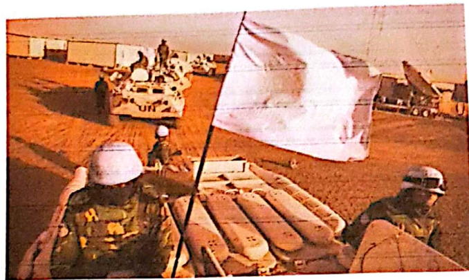
Figure 3: Blue Helmets on the ground - the UN military forces 3

The people from the military personnel of the United Nations are referred to as 'Blue Helmets on the ground'. They work alongside UN Police and civilians, local communities, and security forces, consisting of over 70,000 military personnel coming from armies from across the globe, determined in promoting stability, security, and peace processes.