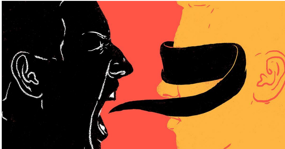
Figure 4: Media Manipulation 16

The effects of disinformation against Ukraine, multi-ethnic groups in West Africa, and western regions of the world prove this is a matter of life or death. The information spread globally impacts how war is handled, which nations get the support they need, and how policies are dealt with during times of crisis. Attention to Ukraine is being suppressed dramatically leaving sufferers vulnerable and bystanders blind. West African nations are praying for the spotlight and disease and discrimination are becoming comical due to disinformation heightened throughout the pandemic. 15 It is crucial to take proactive measures and educate individuals about the dangers of disinformation since anyone can be a victim of this campaign. Media will only become more and more present which is why disinformation must be dismantled now. Through increased global cybersecurity and educating individuals on the importance of reliable resources, future generations will be able to silence disinformation indefinitely. Without solutions, this will not be a world in which the population thrives.