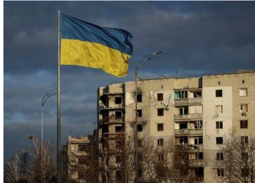
Figure 2: The War in Ukraine 9

and, consequently, there's a profuse amount of inaccuracy and cognitive bias spreading throughout the world. 8 Any individual can be a victim of disinformation by clicking on the first link shown and being blind to its unreliability, possible bias, and dangerous consequences. This is how Russia manipulates the media and the algorithm, the search engine.